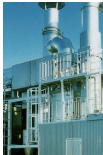
Example installation of Deodorizing equipment