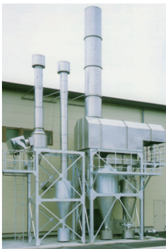
Example installation of type for both exhaust and cooling

Pollution prevention equipment is essential for large-scale plants. We respond to all kinds of environmental problem by using our technology and experience as a manufacturer, including with types that eliminate the smoke on single exhausts and types that eliminate the smoke for both the exhaust and cooling.